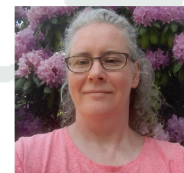
Tracy Monegan Rice Terwilliger Consulting